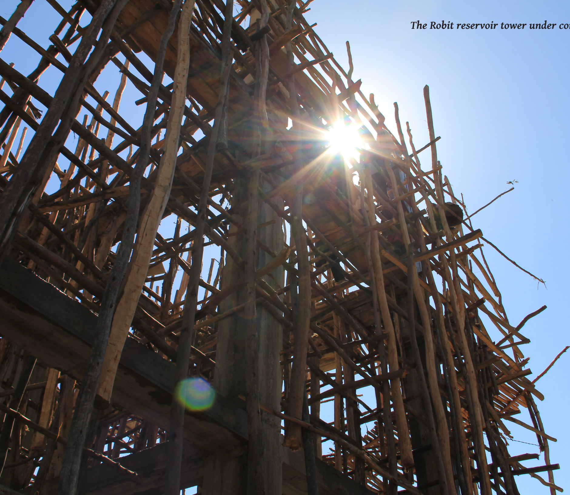
The Robit reservoir tower under construction.

The community of Robit has been a long-term project for Water to Thrive, and is a shining example of how the blessing of clean, safe water can multiply to change the lives of nearly 7,000 people.