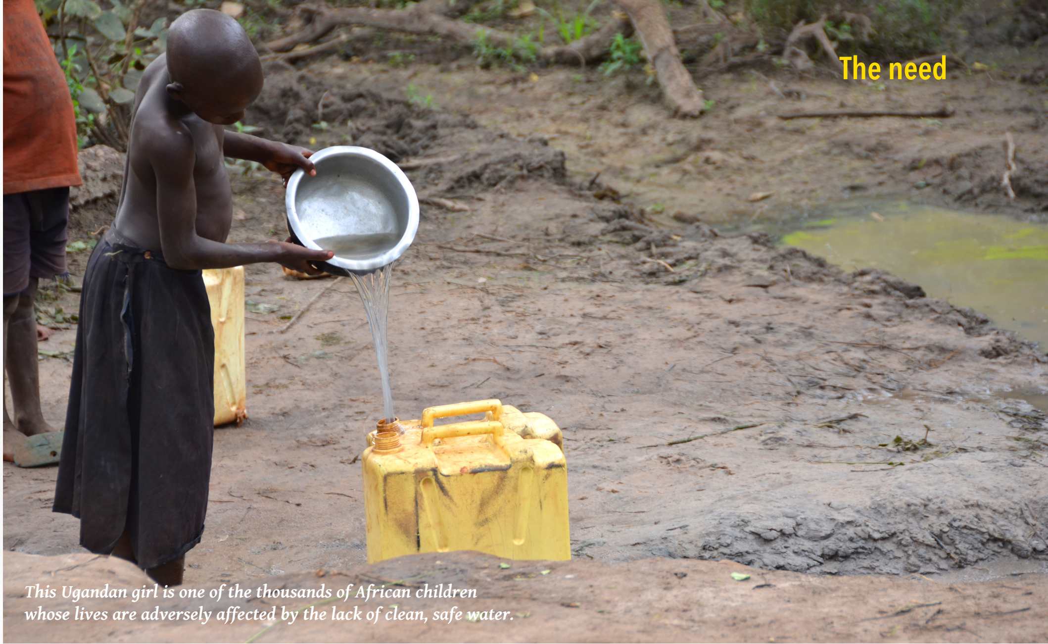
This Ugandan girl is one of the thousands of African children whose lives are adversely affected by the lack of clean, safe water.

Throughout rural Africa, the lack of clean, sustainable water has a devastating impact on the physical and economic health of families and communities. In the countries we serve, more than 75 million people lack daily access to clean water. In these communities without clean water, millions of women and children spend four to six hours a day walking to collect contaminated water. Children – especially girls – are at risk of physical harm when fetching water, and more communities perish from unsafe water than from any form of violence. As Water to Thrive builds wells, we are working to solve these water-related concerns.